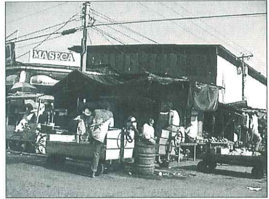
Local corner market